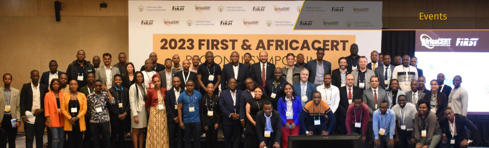
2023 Regional Symposium – Africa *Largest Africa Regional (in-person) to Date*