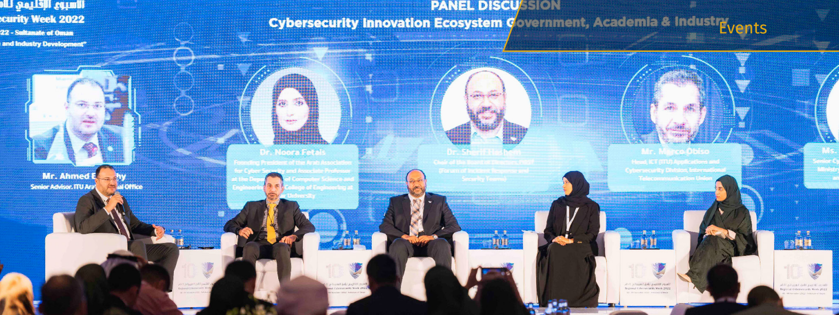
Regional cybersecurity Summit and FIRST & ITU-ARCC Regional Symposium for Africa and Arab Regions